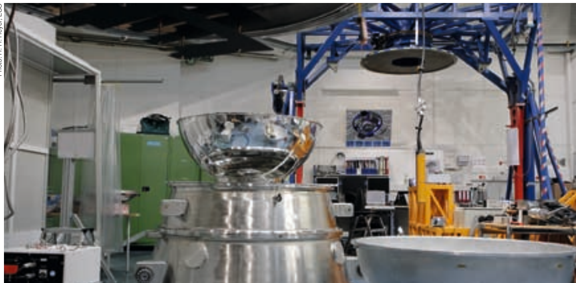
A recent view of the Instrument Integration Hall at ESO Headquarters in Garching. In the foreground are parts of the HAWK-I dewar.