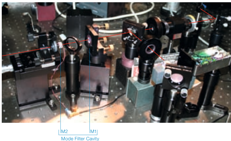
Figure 4 (below): Laboratory set-up at MPQ to test the filter cavity. The red line represents the laser path. On the left, the Fabry Perot filter cavity. On the right, the different optical components for analysis, control and diagnostics.